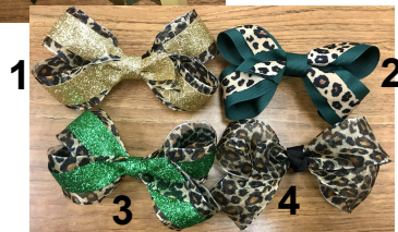
Med. Cheer Bow-$5