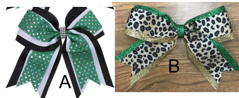
Lg. Cheer Bow-$6