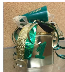
Large Cowbell-$8 4" Gold or Green Bell Various Decorations