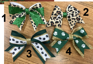
Sm. Cheer Bow-$4